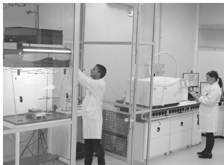
Erلاب's research and filtration testing laboratory

The concentration of the chemical used for the test downstream of the filter must not exceed 50 % of the authorized Occupational Exposure Limit. This phase must not be less than 1/12 of the duration of the normal operating phase.