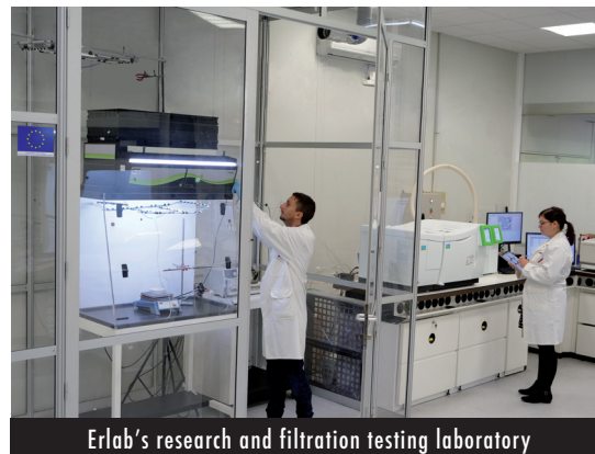
Erlab's research and filtration testing laboratory